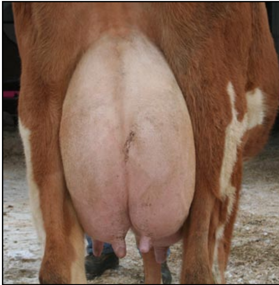
Idle Gold JRZ Flora Dam of Lot 4

01/08 USDA PTA +629M -0.10% +10F +54NM$ 49NM%ile -0.06% +10P +34CM$ 34% Rel 1 Rec YDev: +3135M -27F +45P