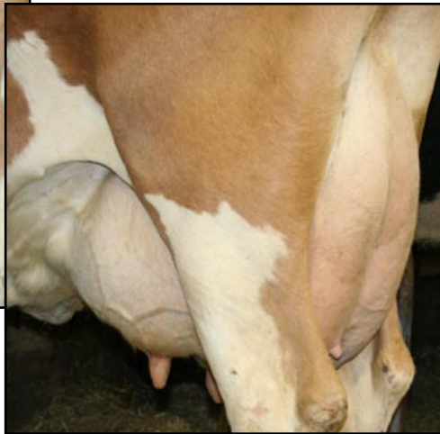
GR-West View Vilter Hellen Dam of Lot 3