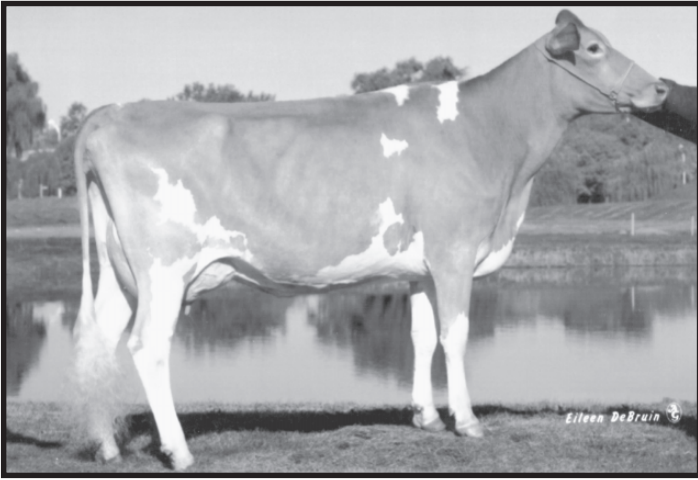
Four Winds Picture Perfect EX-90 4th Jr. 3-Year-Old NGS-Madison 2001 Maternal Family Member of Lot 28-33