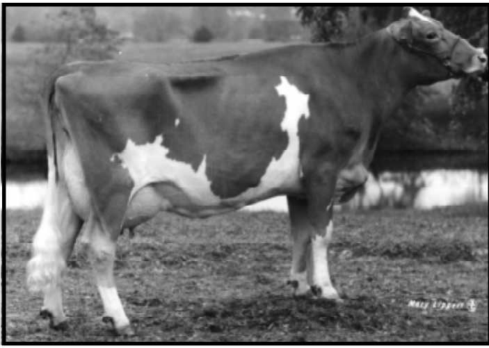
GR-LAESCHLAND FN BAMBI VG-88 HM All-American Jr. 2-Year-Old 1985 Fourth Dam of Lot #11