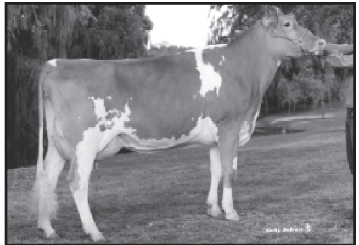
KNAPPS GOLIATH ANDRA EX-91 Nom. All-American Jr. 2-year-old 1997 5th Generation Excellent Maternal Family Member of Lot #14