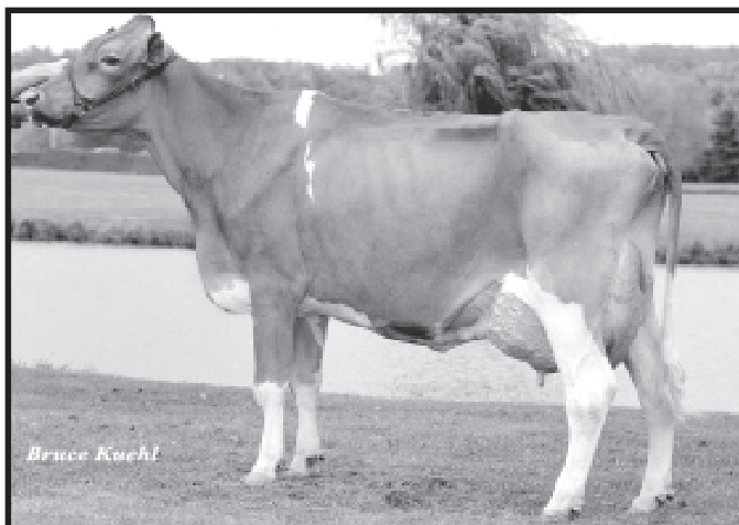
Knapps Enhancer Adeline EX-90 4-03 365D 36,100M 5.4% 1,943F 3.1% 1,115P Dam of Lot 14