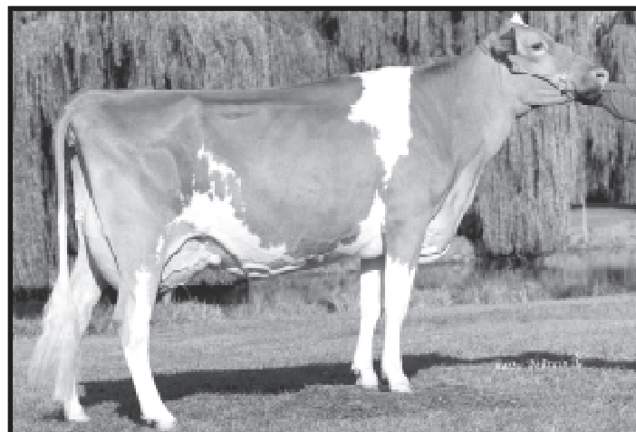
Pinebreeze Telestar Andora EX-95 Res. All-American 3-Year-Old 1988 Fourth Dam of Lot 14

FOURTH DAM: PINEBREEZE TELESTAR ANDORA 00002891647 Appraisal: 95 @ 8-05 4-07 365D 2X 26680M* 4.1% 1084F 3.3% 893P DHIA 6-05 365D 2X 26740M 4.7% 1261F 3.0% 811P DHIA LIFETIME: 156,195M 4.5% 6,976F 3.4% 5,254P RES ALL-AMERICAN 3-YEAR-OLD 1988 1ST 3-YEAR-OLD NGS-MADISON 1988