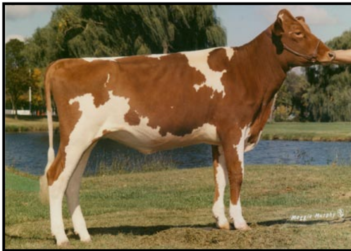
Indian Acres Fays Pumpkin Pie HM All-American Spring Yearling 1999 Granddam of Lot 1