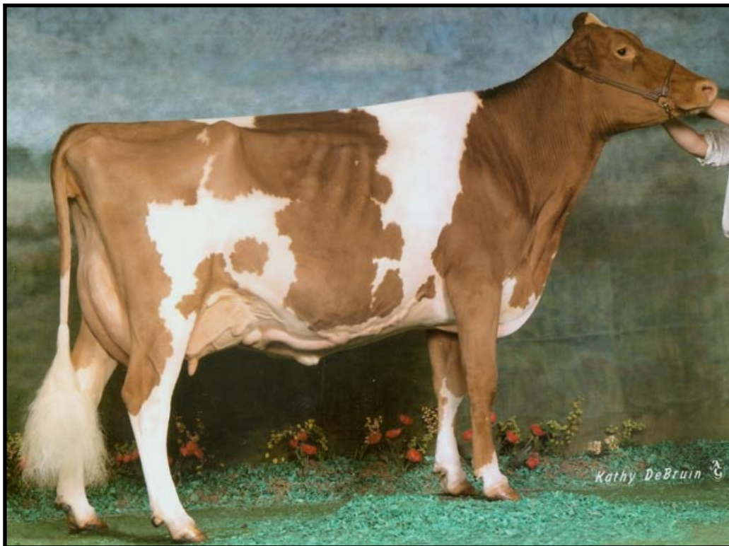
Indian Acres MM Pistachio Pie EX-94 3-09 352D 20,500M 4.6% 944F 3.3% 673P Grand Champion NGS-Harrisburg & Louisville 2007 Dam of Lot 1

PROCEEDS FROM THE SALE OF THE PIE WILL BENEFIT THE AMERICAN GUERNSEY ASSOCIATION'S PROMOTION FUND. HELP YOURSELF AND THE BREED!