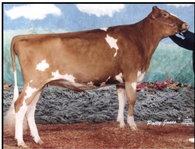
Indian Acres Magicman Peach Pie All-American 2001 & 2002 Full Sister to Dam of Lot 1

Appraisal: 88 @ 4-00 4-03 305D 2X 15310M 4.7% 712F 3.9% 597P DHIR