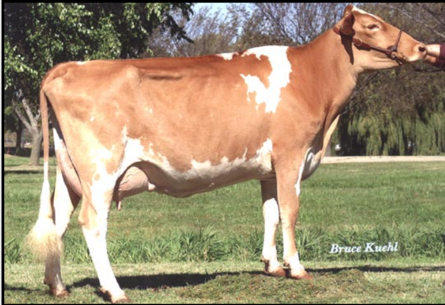
Jaris Hills Loral Ruby VG-87 2-05 305D 20,240M 5.0% 1,007F 3.2% 648P 2nd Sr. 2-Year-Old NJS-Madison 2004