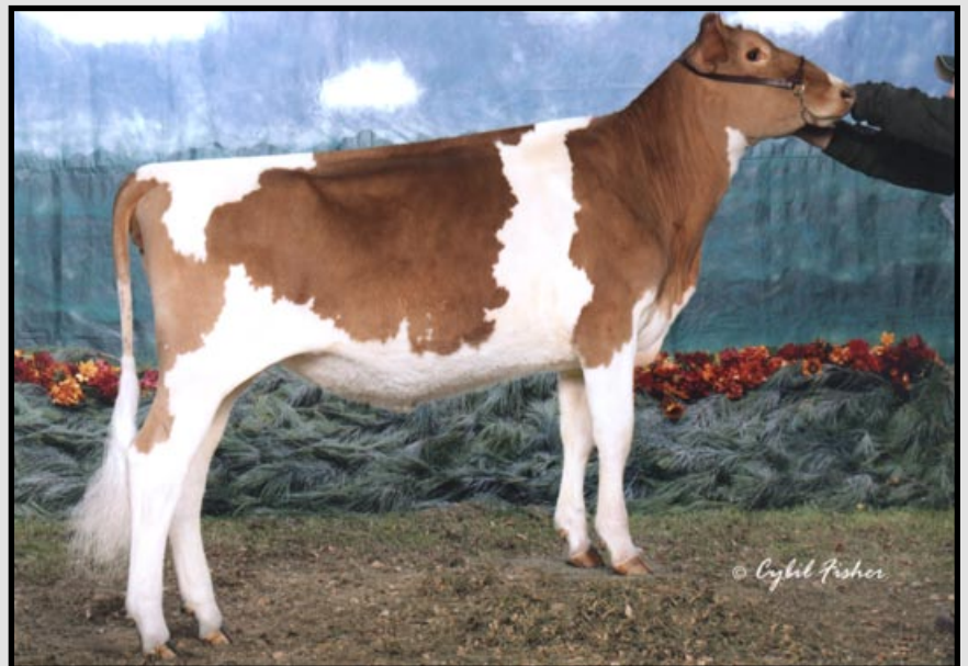
Jaris Hills N Tracy Res. Jr. All-American Fall Yearling 2006 Nom. Jr. All-American Fall Calf 2005

Saturday, June 9, 2007 • 11 a.m. At The Farm, Athens, Wisconsin