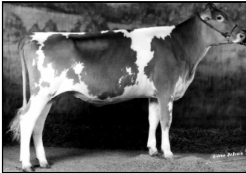
SC Sunny Day Jay Tipster Res. All-American Summer Yearling 1996 Granddam of Lot #22

LOT# 22 $ 1,300 BHGF LORRY TRINITY 003078412