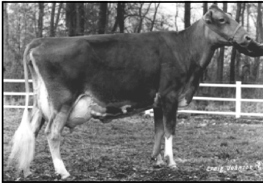
Yellow Creek Magic Carlene EX-90 4-03 305D 18,690M 4.3% 809F 3.6% 678P Paternal Granddam of Lot #34