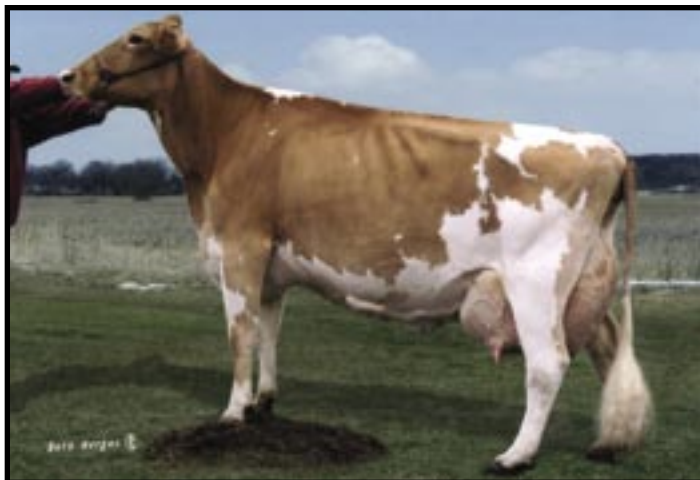
Coulee Crest Valor Krysta EX-90 5-09 360D 41,185M 3.8% 1,555F 3.2% 1,328P Dam of Lot 17