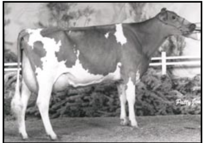
Spring Walk TF Natalie EX-92 Grand Champion Royal Winter Fair 1990 & 1993 Dam of All-American Jr. Best 3 Females 2000 Granddam of Lot 50

FOURTH DAM: SPRING WALK FRANKS NATALIE 2891912 FIFTH DAM: SPRING WALK L C DELIGHT 000002762725 Appraisal: 88 @ 4-03 Gold Star Dam - 1983 11-06 305D 2X 16530M 3.2% 530F 3.2% 525P DHIA