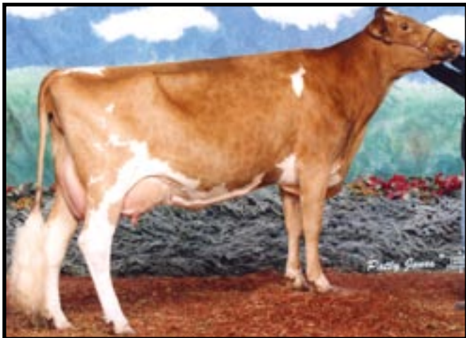
Sun Set Magicman Nat Grand Champion Royal Winter Fair 2002 Nom. All-American Summer Yearling 2000 Maternal Sister to Granddam of Lot 50

THIRD DAM: SPRING WALK TF NATALIE 2935863 Appraisal: EX-92 (CAN) 4-07 305D 2X 21316M 4.2% 902F 3.2% 673P CAN 6-07 305D 2X 19340M 4.2% 821F 3.2% 623P CAN GRAND CHAMPION ROYAL WINTER FAIR 1990 & 1993