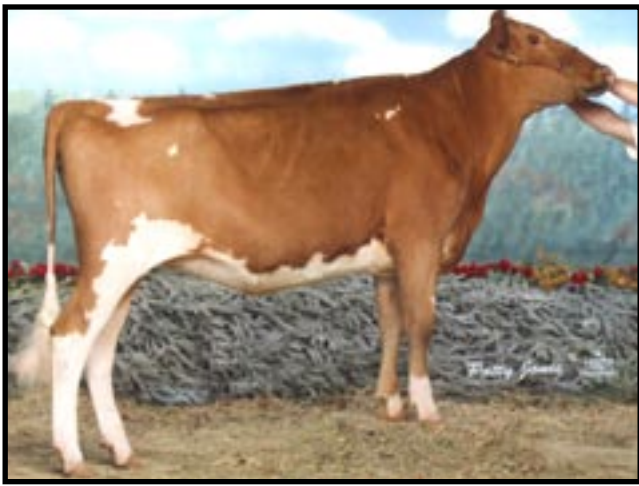
Sun Set Magicman Natalie Ann Res. All-American Winter Calf 2000 Unanimous All-American Winter Yearling 2001 Maternal Sister to Granddam of Lot 50 LOT 50 EMBRYOS - TILLER X NATALISHA