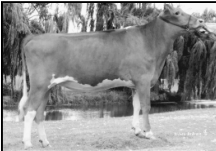
Misty Meadows Nitro Lolagene-ET

RES. JR ALL-AMERICAN SR YEARLING 2004 ALL-WISCONSIN SR YEARLING 2004 1ST SR YEARLING NJS-MADISON 2004 GENETIC MERIT AWARD WINNER NGS-MADISON 2003