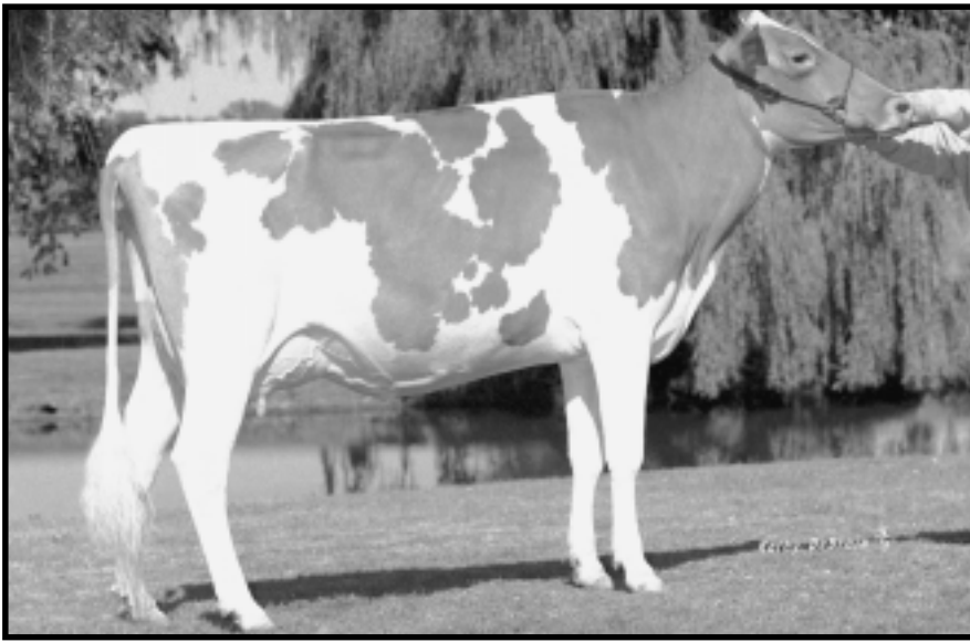
Lone Acres Perfecto Catie EX-91 All-American Int. Yearling & Sr. 2-Year-Old Maternal Family Member of Lot 38