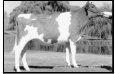
Lone Acres Tiller Cherry HM Jr. All-American Summer Yearling 2004 Granddaughter of Catie