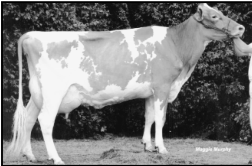
Low Brook Goldfoot Connie G EX-90 2-00 365D 3X 29,014M 4.1% 1,193F 3.1% 903P Dam of Lot 39