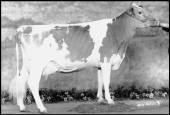
Campbells Cocheese Magio VG-87

Quan, Magio & Gilda made up the All-American Best Three Females in 2000! That Quality is still here!