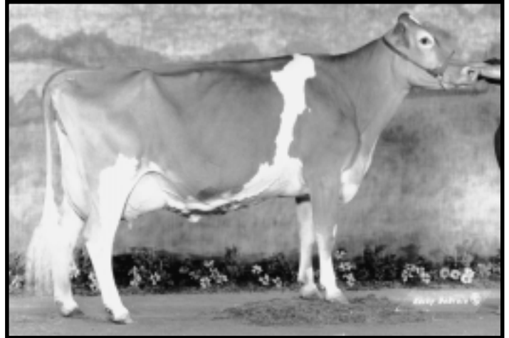
Campbells Pauls Gilda EX-92

All-American Jr. 3-Year-Old 2000 Two Granddaughters in the Herd!