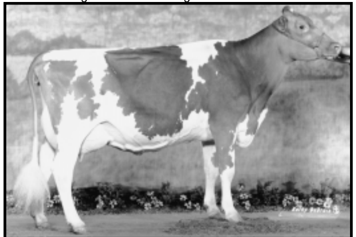
Campbells Woodrows Quan EX-92

All-American Int. Calf 1997 - HM All-American 1998 Two Granddaughters in the Herd