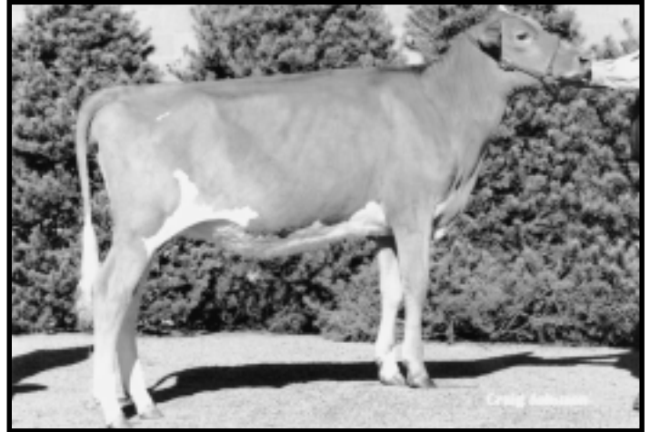
Campbells Rodney's Unify

All-American 2001 - Res. All-American 2003 & 2004 Her stunning EX-90 Dam and a full sister are in the herd!