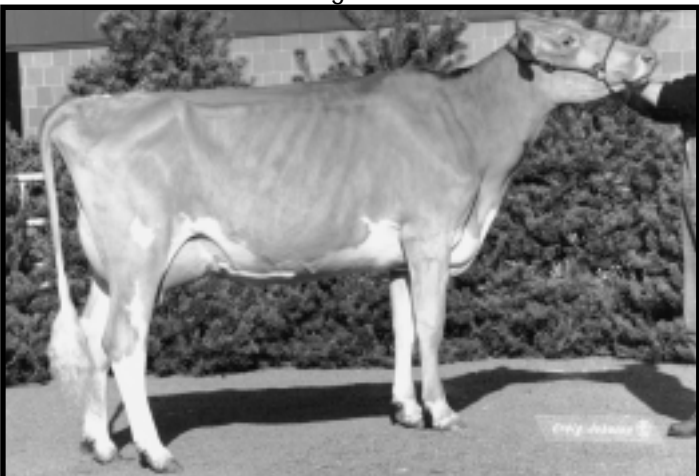
Campbells Kings Lorene VG-87

All-American Aged Cow 2000 A Daughter & Granddaughter are in the Herd!