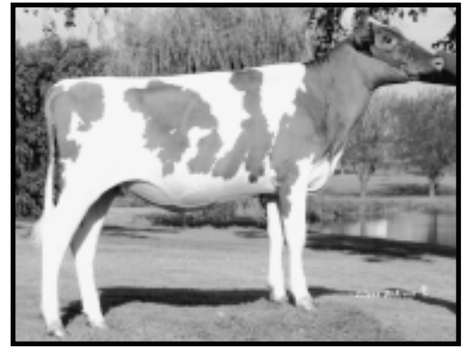
Misty Meadows Tiller Patience Nom. All-American Dam & Daughter 2004 Maternal Sister to Lot 7