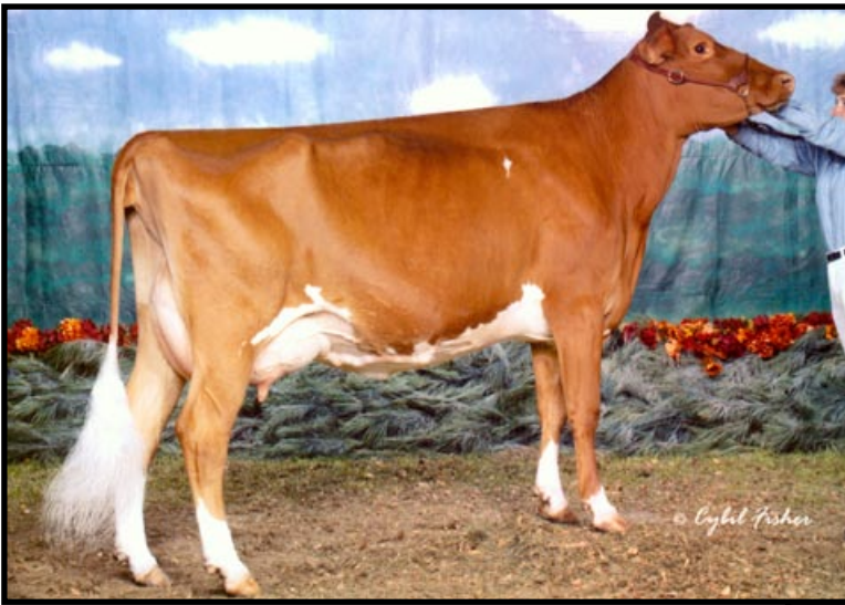
Rae Mar Fayette Lily EX-92 Res. All-American Sr. 2-Year-Old 2004 Full Sister to Dam of Lot 21