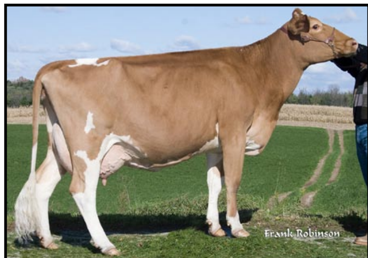
Maplehurst Roger Breanne VG-88 1st 2-Year-Old Canadian National Show 2005 Dam of Lot 25

MAPLEHURST SHARPS BUNNY 10032771 Appraisal: EX-90 3E CAN 2-01 305D 2X 14835M 4.3% 640F 3.5% 526P CAN 3-03 305D 2X 15657M 5.1% 796F 3.7% 581P CAN 4-03 305D 2X 14428M 5.0% 728F 3.8% 543P CAN 5-05 305D 2X 14414M 4.8% 697F 3.6% 513P CAN 6-10 305D 2X 13549M 4.9% 660F 3.6% 493P CAN