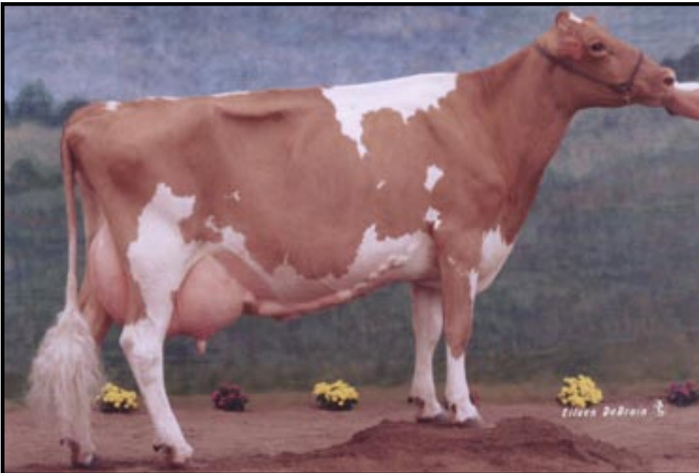
Sniders Sharp Daze EX-91 6-11 365D 30,720M 1,256F 1,010P HM Jr. All-American Aged Cow 2004 Dam of Lot 11B & Granddam of Lot 11A