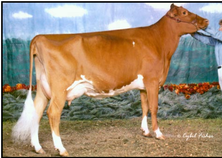
Rae Mar Fayette Lily EX-92 Res. All-American Sr. 2-Year-Old 2004 Full Sister to Dam of Lot 37