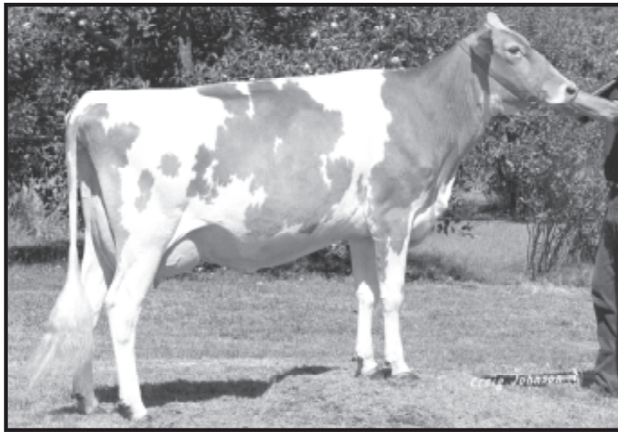
Green Ridge Luxury Sarah VG-88 5-03 333D 18,110M 4.2% 753F 3.6% 646P Dam of Lot # 45