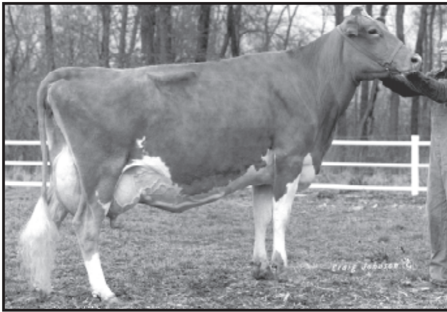
Green Ridge Clarion Emma EX-90 Dam of Lot #48