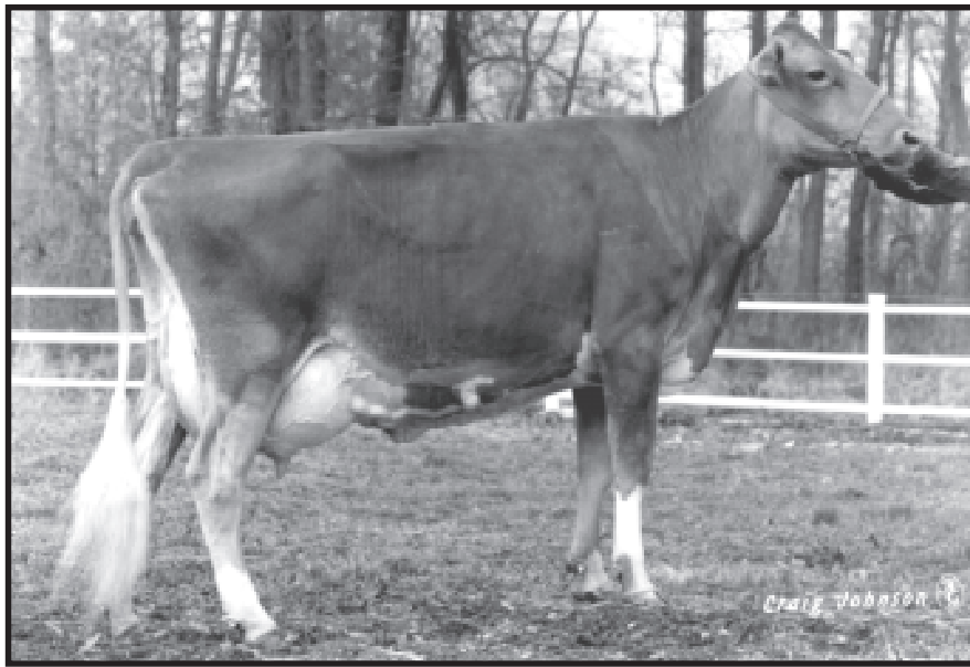
Yellow Creek Magic Carlene EX-90 Paternal Granddam of Lot # 57