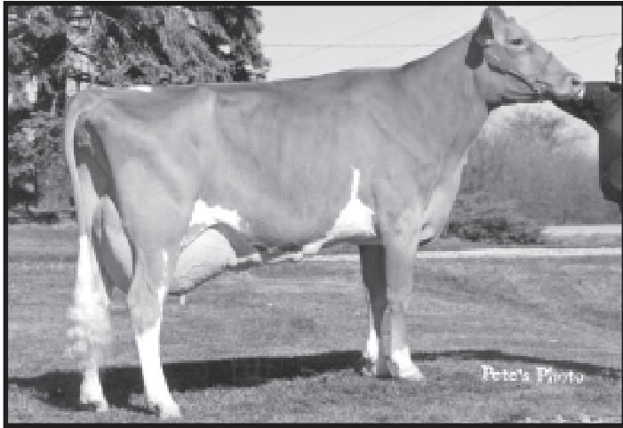
Cedar Way Sly Vivian VG-88 Nom. All-American 4-Year-Old 2000 Paternal Granddam of Lot # 37

SIXTH DAM: PLEASANT VALLEYS FAY IDA 000002883362 Appraisal: 88 @ 5-02 4-06 365D 2X 22050M 4.9% 1088F 3.4% 757P DHIA