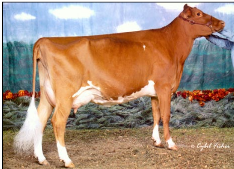
Rae Mar Fayette Lily-ET EX-92 Res. All-American Sr. 2-Year-Old 2004 Granddam of Lot 11