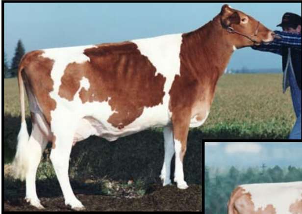
Eby Manor Billboard Wonder EX-90 Maternal Sister to Granddam of Lot 18

2-08 305D 2X 10450M 4.5% 469F 3.4% 357P 94