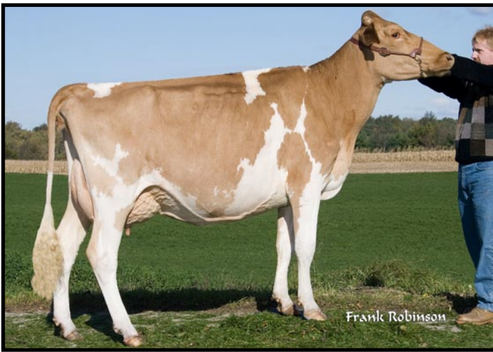
Maplehurst Bids JB Barbara VG-88 @ 3-09 2-04 365D 23,155M 3.8% 871F 3.2% 732P 1st Sr. 2-Year-Old Canadian National '06 Maternal Sister to Granddam of Lot 1