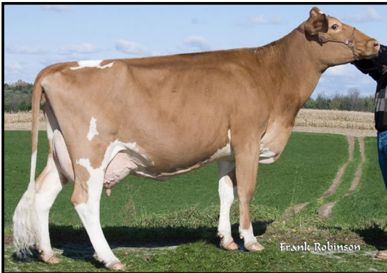
Maplehurst Roger Breanne EX-91 1st 2-Year-Old Canadian National '05 3-03 365D 20,003M 4.5% 902F 3.8% 761P Dam of Lot 1

DAM OF: LAESCHLAND TEX BID PTI -104 LAESCHLAND CHOICE ADM BIONIC PTI -16 LAESCHLAND NPK BRIGHTON-ET PTI -88 LAESCHLAND PENDER BILLIE JEAN 92 @ 4-07 3-08 365D 2X 31970M* 4.0% 1293F 3.3% 1046P* DHIA LAESCHLAND FRANK BLAIR 88 @ 4-09 2-01 365D 2X 24720M 4.7% 1151F 3.4% 832P DHIA LAESCHLAND MERCURY BRIDGET 87 @ 2-06 LAESCHLAND PERFECT BLISS-ET 92 @ 4-07 3-08 365D 2X 35220M* 3.9% 1382F* 3.6% 1253P* DHIA GRAND CHAMPION NGS-MADISON 1999 ALL-AMERICAN 4-YEAR-OLD 1999 FORMER #1 CPI COW RES. ALL-AMERICAN SR 3-YEAR-OLD 1998 DAM OF MY DAY BLISS BANGER-ET & RIPLEY FARMS HOTSHOT BRYANT