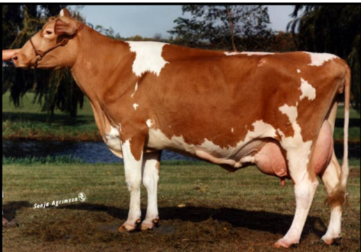
Laeschland T S Biddy EX-94 9-03 365D 28,930M 4.5% 1,298F 3.4% 995P Fifth Dam of Lot 1