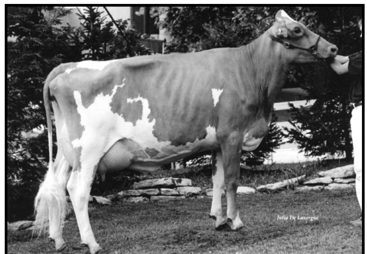
Maplehurst Barbie-ET VG-88 2-04 330D 18,860M 4.4% 835F 3.8% 712P Nom. Jr. All-American Jr. 2-Year-Old 2004 Maternal Sister to Granddam of Lot 1