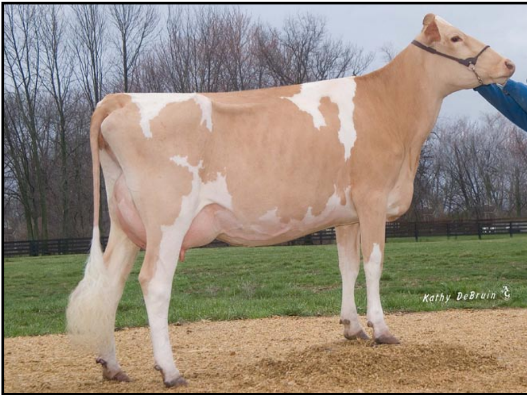
Dymond H Mentor BabyRuth Nom. All-American Fall Calf 2006 Sells As Lot 12