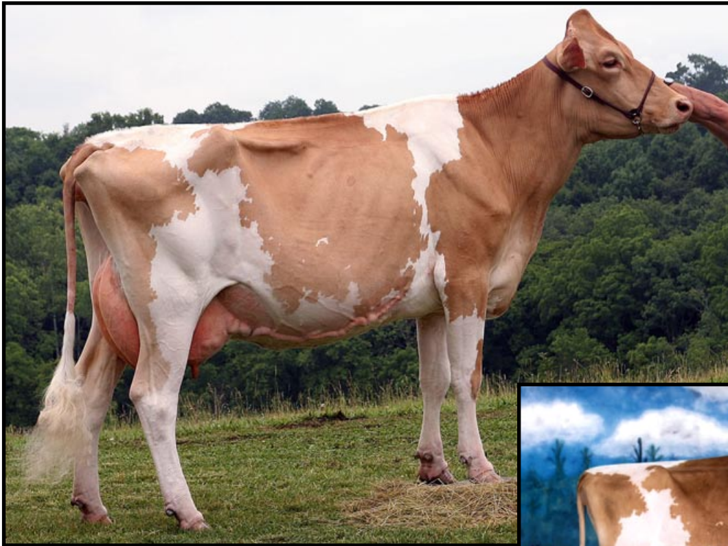
Rolling Prairie N Ruthann EX-90 Nominated All-American 3 Times! Dam of Lot 12