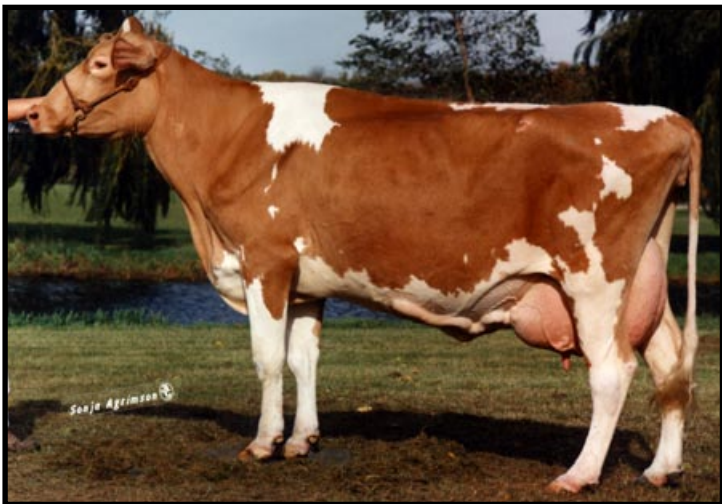
Laeschland T S Biddy EX-94 9-03 365D 28,930M 4.5% 1,298F 3.4% 995P Fifth Dam of Lot 29