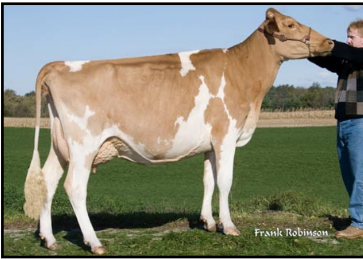
Maplehurst Bids JB Barbara VG-88 @ 3-09 2-04 365D 23,155M 3.8% 871F 3.2% 732P 1st Sr. 2-Year-Old Canadian National '06 Maternal Sister to Granddam of Lot 29