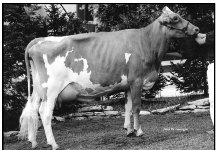
Maplehurst Barbie-ET VG-88 2-04 330D 18,860M 4.4% 835F 3.8% 712P Nom. Jr. All-American Jr. 2-Year-Old 2008 Maternal Sister to Granddam of Lot 29