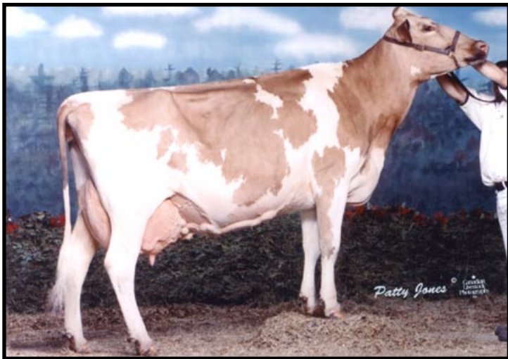
Maplehurst Diplomats Bid EX-90 Grand Champion Royal Winter Fair 2000 Dam of 2008 All-American 5-Year-Old 3rd Dam of Lot 29