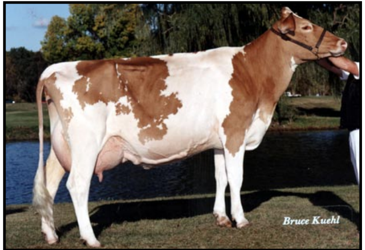
Maplehurst BB Biddy HM All-American Jr. 3-Year-Old 1999 Maternal Sister to 3rd Dam of Lot 29