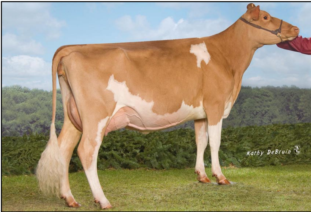
Chupps Farm Mentor Mary HM All-American Sr. 2-Year-Old 2009 Maternal Sister to Lot 5