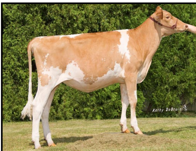
Ripley Farms AD Coni Wisper Res. All-American Summer Yearling 2009 Maternal Sister to Lot 14 & Dam of Lot 15

RIPLEY FARMS T CONI HOPE-ET 84 @ 3-11 (80/87) 2-01 357D 3X 21000M 4.9% 1026F 3.1% 658P 97 RIPLEY FARMS GL CONI IRENE-ET 84 @ 3-06 (84/87) 3-05 337D 3X 25310M 4.9% 1241F 3.5% 880P DHIA RIPLEY FARMS SP CONI PEARL-ET 82 @ 3-05 (80/74) 2-07 305D 3X 18060M 4.0% 727F 2.9% 522P DHIA RIPLEY FARMS SP CONI SUE-ET 82 @ 2-10 (82/85) 2-04 365D 2X 25550M 4.3% 1086F 3.3% 851P DHIA RIPLEY FARMS A CONI TESS-ET 84 @ 3-00 (84/88) 2-07 365D 3X 17230M 4.2% 729F 3.5% 595P DHIA RIPLEY FARMS A CONI ZOEY-ET 82 @ 3-00 (82/83) 1-11 305D 2X 18870M 5.1% 969F 3.4% 651P DHIA RIPLEY FARMS D CONI ANGEL-ET 82 @ 2-10 (81/77) 2-07 305D 3X 13500M 4.7% 630F 3.1% 421P DHIA RIPLEY FARMS T CONI DESIRE-ET 84 @ 2-03 (84/86) 2-01 305D 2X 22070M 4.2% 922F 3.2% 705P DHIA RIPLEY FARMS C CONNIE GAIL-ET 82 @ 2-08 (84/82) 2-00 314D 3X 16780M 4.5% 761F 3.2% 543P DHIA RIPLEY FARMS CONI FAYE-ET 83 @ 2-09 (83/83) 1-11 305D 3X 16940M 4.8% 820F 3.5% 592P DHIA RIPLEY FARMS CONI HOLLY-ET 82 @ 2-03 (83/86) 2-00 346D 3X 18800M 5.0% 932F 3.5% 650P DHIA RIPLEY FARMS R CONNIE LOU-ET 85 @ 2-07 (85/83) RIPLEY FARMS SP CONI OLISA-ET 82 @ 2-08 (82/78)