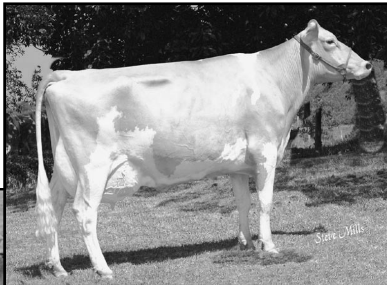
Marfred Enticer Phoem EX-90 4th Dam of Lot 49