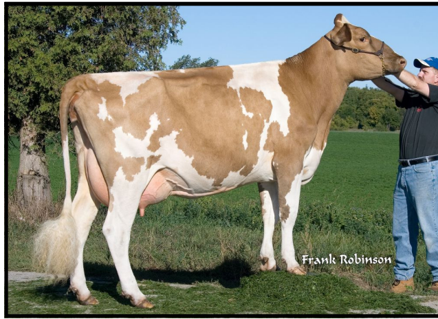
Maplehurst Russ Music VG-87 @ 2-07 1st Sr. 2-Year-Old Canadian National Show '07 Maternal Family Member of Lot 15