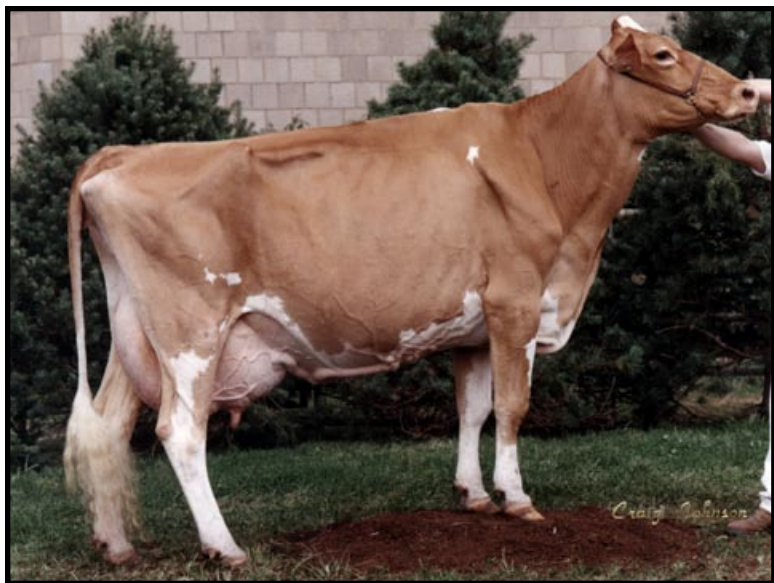
Terphill Perfecto Mitzby EX-94 Res. All-American Aged Cow 2003 Granddam of Lot 64

TERPHILL HUNTER MISSLE-ET 90 @ 7-09 (90/80) 5-11 305D 2X 25860M 4.1% 1066F 3.0% 776P 91 TERPHILL JASPER MICKEY 89 @ 2-08 2-03 268D 2X 12260M 3.4% 421F 3.2% 391P DHIR TERPHILL SHARP MISSY 90 @ 5-08 (90/91) 3-04 325D 2X 17940M 4.6% 827F 3.4% 618P 81 TERPHILL BILLY MITZE 90 @ 4-00 (88/85) 3-10 305D 2X 14440M 4.3% 618F 3.1% 451P 100 TERPHILL TRUMPET MIRANDA-ET 84 @ 4-02 (84/85) 2-06 305D 2X 11270M 4.3% 485F 3.2% 361P DHIA TERPHILL LOGIC MINT-ET 77 @ 3-07 (75/83) 3-04 299D 2X 9150M 4.9% 444F 3.4% 314P 95 TERPHILL HUNTER MISS-ET 85 @ 3-04 (85/85) 3-01 300D 2X 8710M 4.8% 415F 3.8% 327P 97