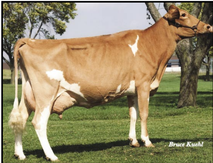
Misty Meadows SG Nitro Lucy-ET EX-91

Appraisal: 91 @ 11-05 9-05 365D 2X 15000M 4.9% 739F 3.7% 561P DHIA GRAND CHAMPION MN STATE FAIR 1992