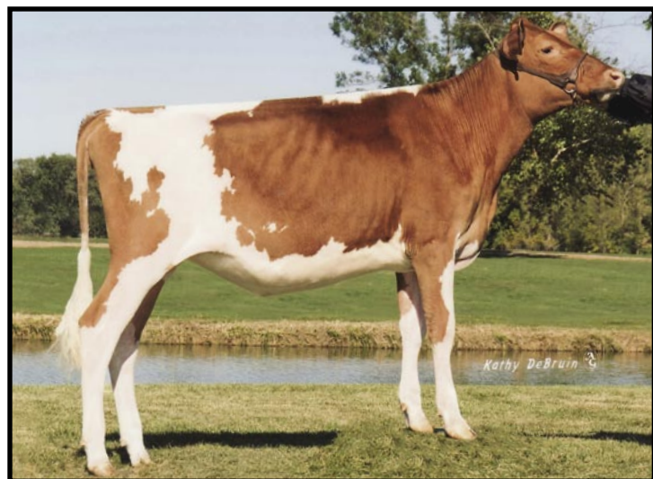
Faria Farms Challenge Noelle Nom. All-American Winter Calf 2008 Maternal Sister to Lot 52

FARIA SELECT CHALLENGE NACHO-ET @ SELECT SIRES FARIA FARMS MESSENGER @ GOLDEN STATE BREEDERS FARIA FARMS A PIE NANCY-ET 1ST WINTER YEARLING NY SPRING SHOW 2010 FARIA FARMS CHALLENGE NOELLE NOM. ALL-AMERICAN WINTER CALF 2008