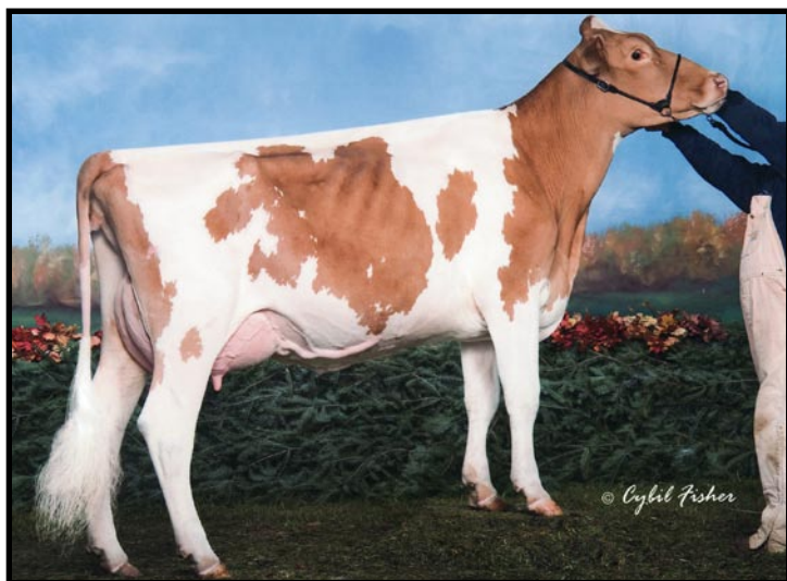
Adams Creek Regal Dancer VG-88 HM All-American Jr. 2-Year-Old 2009

Appraisal: 91 @ 8-06 2279D 107,080M 4.5% 4,804F 3.4% 3,589P LIFE