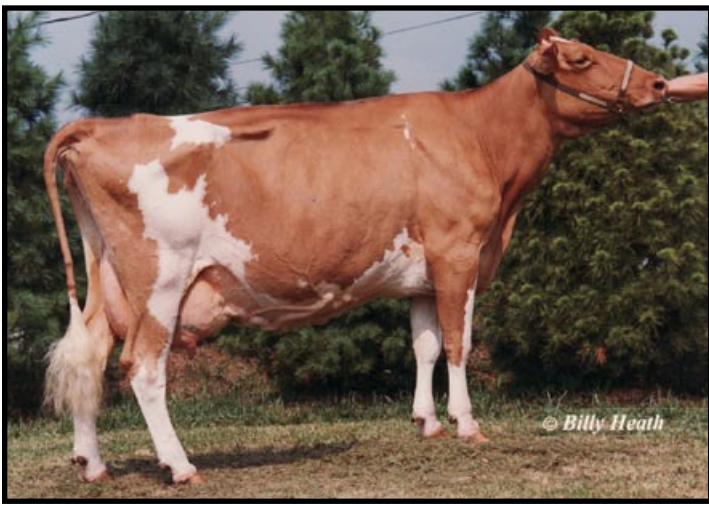
Crown Stone Quantity Alfalfa EX-91 142,490M 5.3% 7,552F 3.6% 5,123P Life 4th Dam of Lot 06