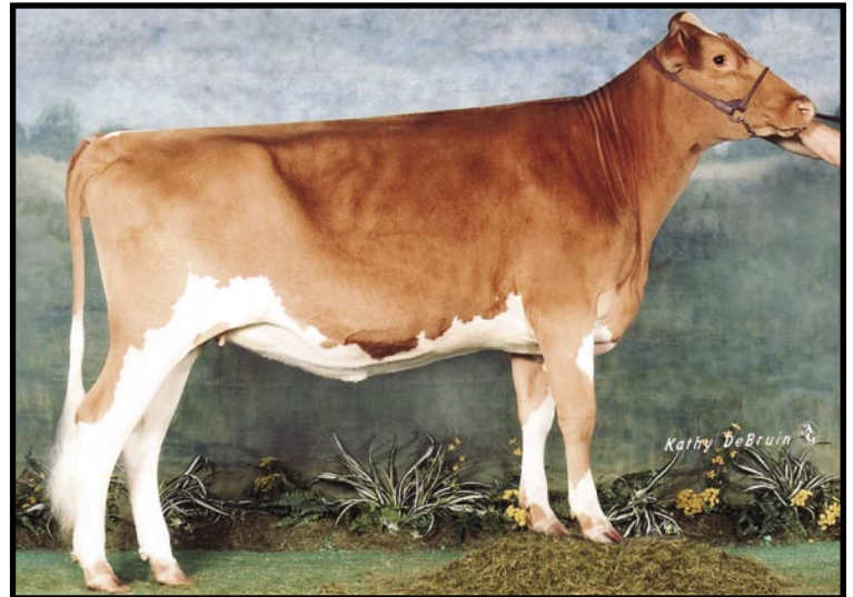
Knapps Goldprint Castro Ribbon