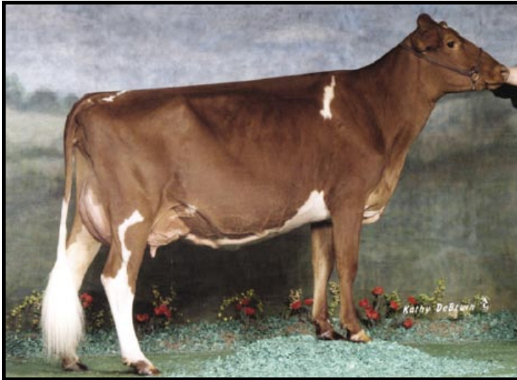
Cedar Way Vilter Kortney VG-87