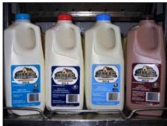
Warwick Manor Farm has Golden Guernsey Milk back on store shelves! They are selling skim, 1 1/2%, whole and chocolate milk at Yoder's Country Market in New Holland, Pa. To read more about this turn to page 34.