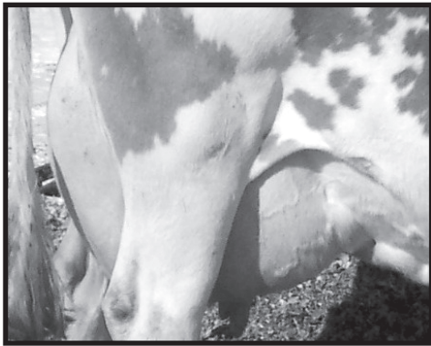
Future Farms Lord Trudy Torry VG-86 Dam of Lot 8

02/05 USDA PTA -99M +0.06% +5F -85NM$ 20NM%ile -0.02% -7P -92CM$ 64% Rel 5 Rec YDev: +455M +59F +15P 3 App 02/05 PTAT +0.3 54% Rel CPI +1 Appraisal: 90 @ 6-11 2-00 305D 2X 10280M 4.8% 495F 3.3% 343P DHIR 3-01 305D 2X 14650M 4.6% 678F 3.5% 519P DHIR 4-01 305D 2X 14680M 4.7% 697F 3.5% 521P DHIA 5-04 305D 2X 15110M 5.0% 762F 3.3% 498P DHIA 6-08 321D 2X 16030M 4.9% 788F 3.1% 495P DHIA BO KA TRUDY SHARP TAYLOR 2-02 256D 2X 12070M 4.7% 569F 3.4% 410P DHIA