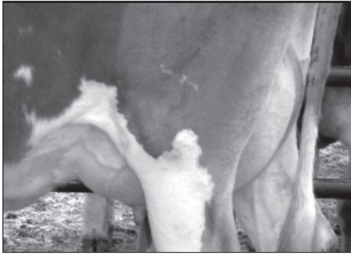
Maple Bud Ryans Page Dam of Lot 19

LOT 19 $1,000 MAPLE BUD S MAGIC PHILLY 000068002676