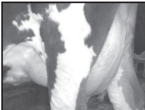
Majestic Oak Mr Luck Sharrie Dam of Lot 18