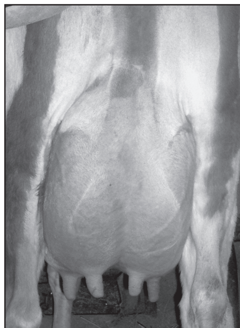
Donnybrook R Julien VG-84 Dam of Lot #13