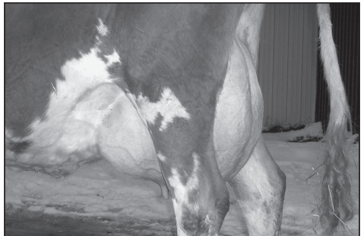
Majestic Oak Bryant Susan EX-90 2-00 315D 15,930M 4.3% 684F 3.5% 557P Dam of Lot #3

11/05 USDA PTA +600M -0.07% +14F +231NM$ 94NM%ile +0.01% +22P +238CM$ 42% Rel 1 Rec YDev: +2371M +67F +95P 1 App 11/05 PTAT +0.8 40% Rel CPI +91 Appraisal: 90 @ 3-01 (90/90) ST SR BD DF RA TW RL FA FU RH RW UC UD TP TL 38 37 40 42 25 35 25 20 28 43 35 44 25 20 20 2-00 315D 2X 15930M 4.3% 684F 3.5% 557P 93 3-00 55D 2X 3751M 3.5% 131F 3.4% 128P RIP 305D 2X 16911M PROJECT