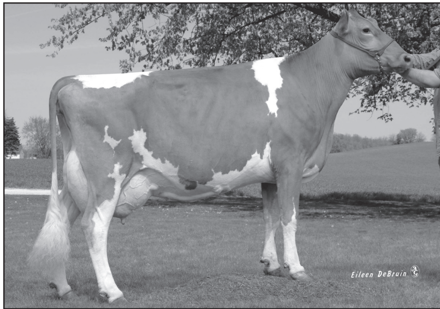
Majestic Oak Lewis Supreme EX-91 4-00 318D 19,310M 4.6% 892F 3.6% 693P Granddam of Lot #3